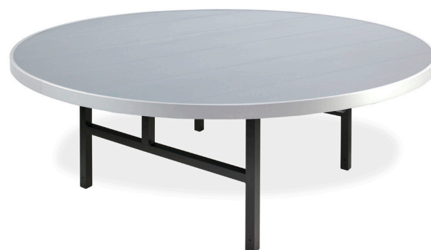
Model #: A72RPHL Matte Silver Finish w/ Black legs