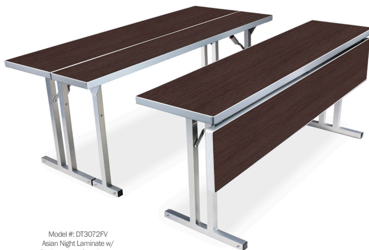
Model #: DT3072FV Asian Night Laminate w/ Platinum legs & perimeter