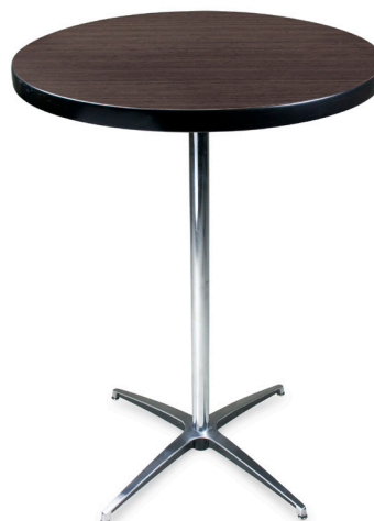
Model #: D30RFV42KD Park Elm Laminate w/ Black perimeter