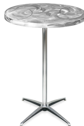
Model #: SA30RP42KD Satin Finish