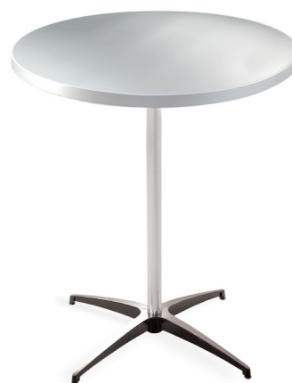
Model #: A30RP42KD Matte Silver Finish